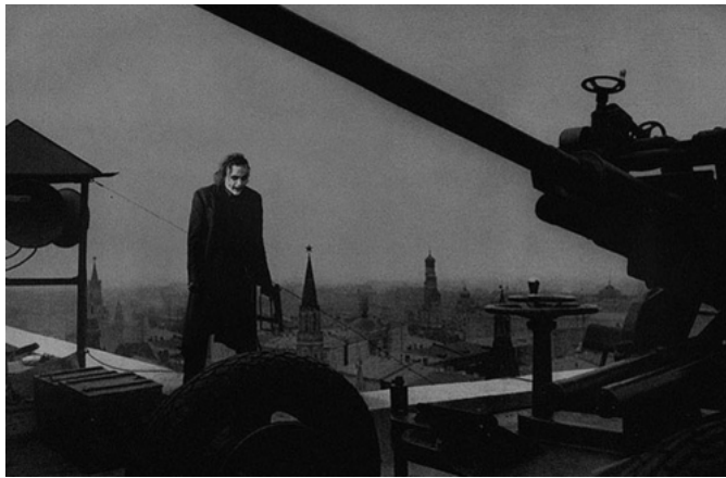
External post defense on the hotel roof. Moscow, 1941. By October 13, 1941, the Wehrmacht had arrived at the Mozhaik defense line. Zhukov decided to concentrate his forces at four critical points: Volokolamsk, Mozhaik, Maloyaroslavets and Kaluga. The entire Soviet Western Front almost completely destroyed after its encirclement near Vyazma, was being recreated from scratch.