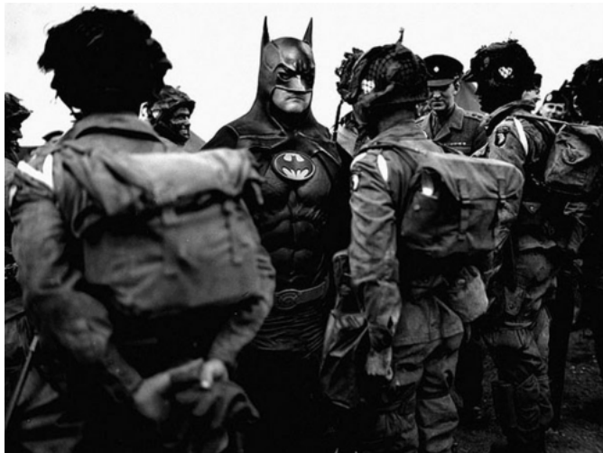
Image Credits: Greenham Airfield, June 5, 1944 - He gives the order of the Day : 'Full victory-nothing else !' to paratroopers in England, just before they board their airplanes to participate in the first assault in the invasion of the continent of Europe. Greenham Common Airfield in England about on June 5, 1944. | (C) agan harahap