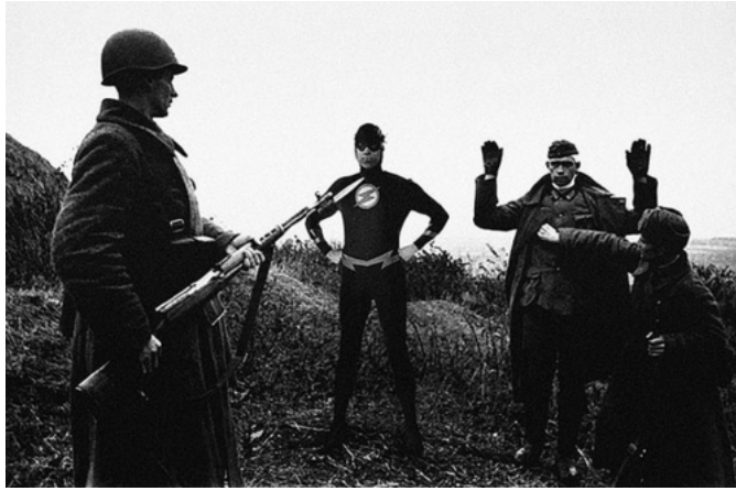
Image Credits: Captivity of German Soldiers, 25 april 1945 - Following the unconditional surrender of the Wehrmacht which went into effect on 8 M 1945, some Wehrmacht units remained active, either independently (e.g. in Norway), or under Allied command as police forces.[7] By the end of Ar 1945, these units had been dissolved, and a year later on 20 August 1946, the Allied Control Council declared the Wehrmacht as officially abolish agan harahap