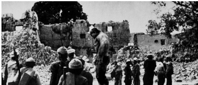
Afghan, 1986 - Afghan resistance fighters returning to a village destroyed by Soviet forces, 1986]