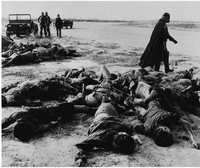
Image Credits: Saigon 1968 - Viet Cong dead after an attack on the perimeter of Tan Son Nhut AirBase. Source Vietnam Center and Archive 1 Feb | (C) agan harahap