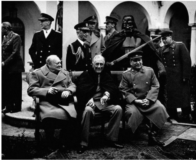
Yalta Conference, February 1945. Conference of the Big Three at Yalta makes final plans for the defeat of Germany. Here the Big T sit on the patio together, Prime Minister Winston S. Churchill, President Franklin D. Roosevelt, and Premier Josef Stalin. February 1945.