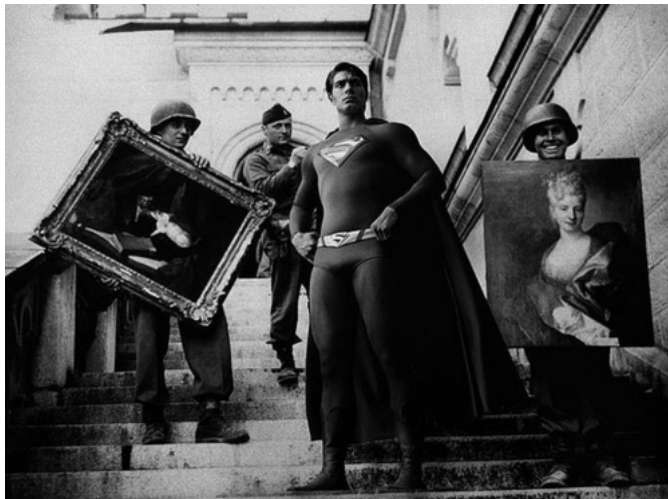
Image Credits: Neuschwanstein 1945 - Stolen Art at Neuschwanstein Castle, 1945. Soldiers from the 7th US Army carry the priceless artworks dov steps of Meunschwanstein Castle where hoards of European art treasures, stolen by the Nazis, were hidden during World War II.] (C) agan haraha