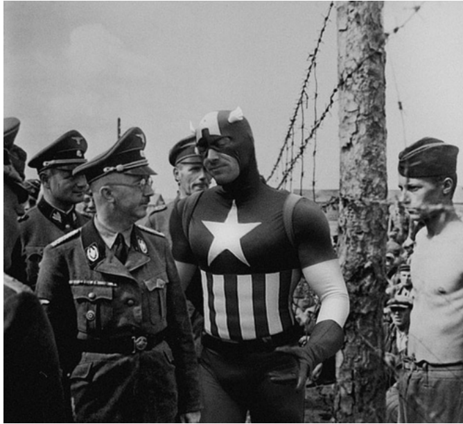
Image Credits: A Camp Near Minsk 1941 - Heinrich Himmler inspects a prisoner-of-war camp in Russia. | (C) agan harahap