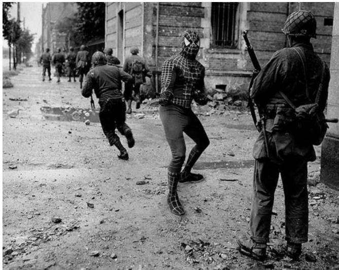
Image Credits: Cherbourg-Normandy 1944. Soldats américains se livrant à des combats de rue, avenue de Paris, Cherbourg-Normandy 1944 | (C) harahap