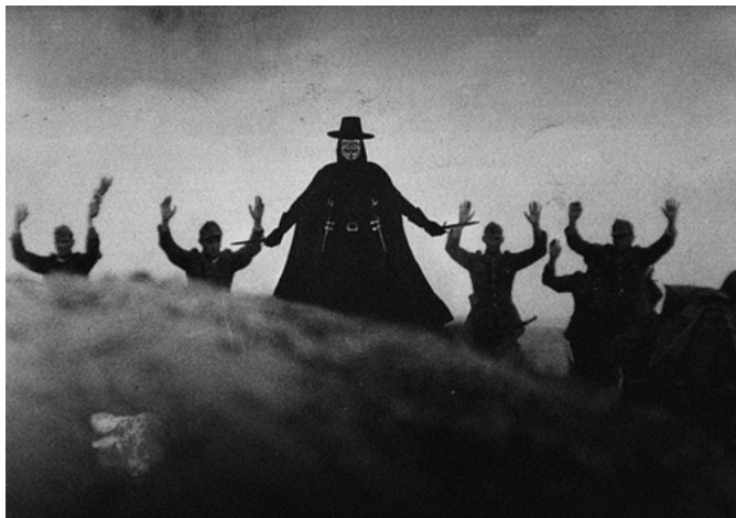
Image Credits: Taret de Ravenoville, June 1944 - Soldiers of the Wehrmacht go hands in the air. June 9, 1944, German soldiers are brought back to the beach. The photo was taken in the sector of Taret Ravenoville. The coastal area between Utah and Quinéville was cleaned of June 7 to 13 men by the 22nd Airborne Division. (C) agan harahap