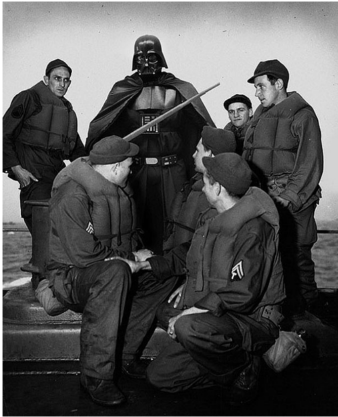
Image Credits: Curtis Bay, 1943 - Navy Coast Guard, in October 1943| (C) agan harahap